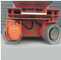
TIGHT TURNING RADIUS RAM STEERING