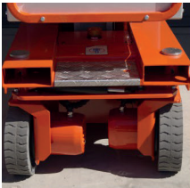
EMERGENCY LOWERING SYSTEM