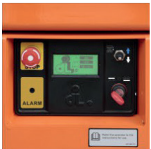
TOUCH DISPLAY SCREEN