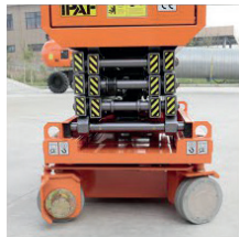
TIGHT TURNING RADIUS RAM STEERING