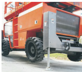
AUTOMATIC LEVELLING OUTRIGGERS