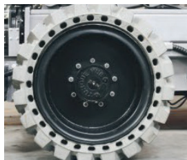
NON MARKING TYRE