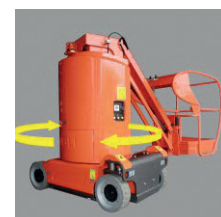
345° TURRET ROTATION