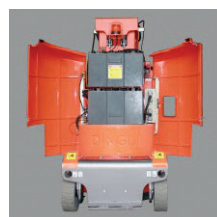
SWING OUT COMPONENTS COVER