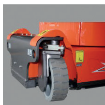
TIGHT TURNING RADIUS RAM STEERING