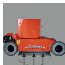
AUTOMATIC POTHOLE PROTECTION