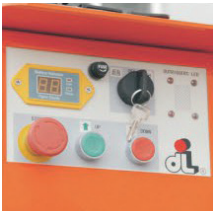
GROUND CONTROL WITH OUTRIGGER LEDS