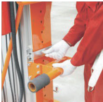
ADJUSTABLE PICKUP RAIL