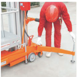
SWING OUT OUTRIGGERS WITH INTERLOCK SYSTEM