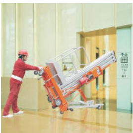
TILT BACK FRAME