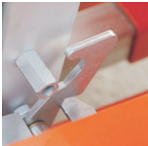
TRANSPORT LOCK HOOK