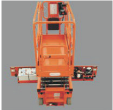
SWING OUT TRAYS