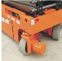
TIGHT TURNING RADIUS RAM STEERING