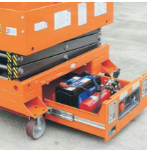
SLIDE OUT TRAY